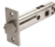
Stainless steel tubular latch* (Most popular)